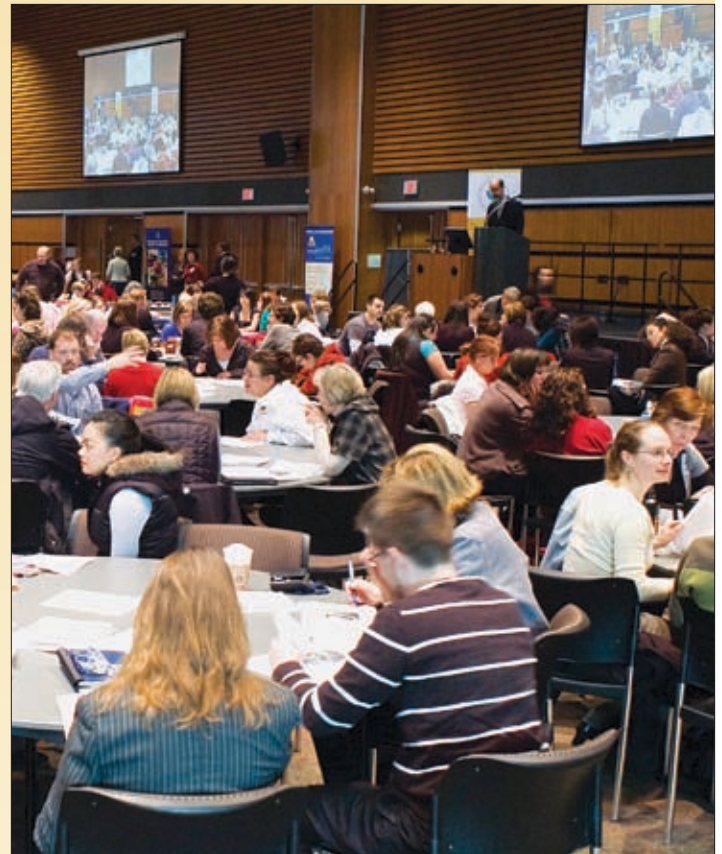
A full house at the Mount Royal Symposium on Stigma

In early April 2009, the Anti-stigma Team will send two “Requests for Interest” (RFI) seeking proposals from groups or individuals across Canada already involved in operating programs targeted at reducing stigma and discrimination related to mental illness. The purpose of the RFIs is to identify and then engage organizations to partner with the Commission. Programs that are selected