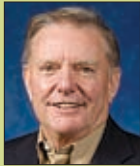
Michael Kirby Chair