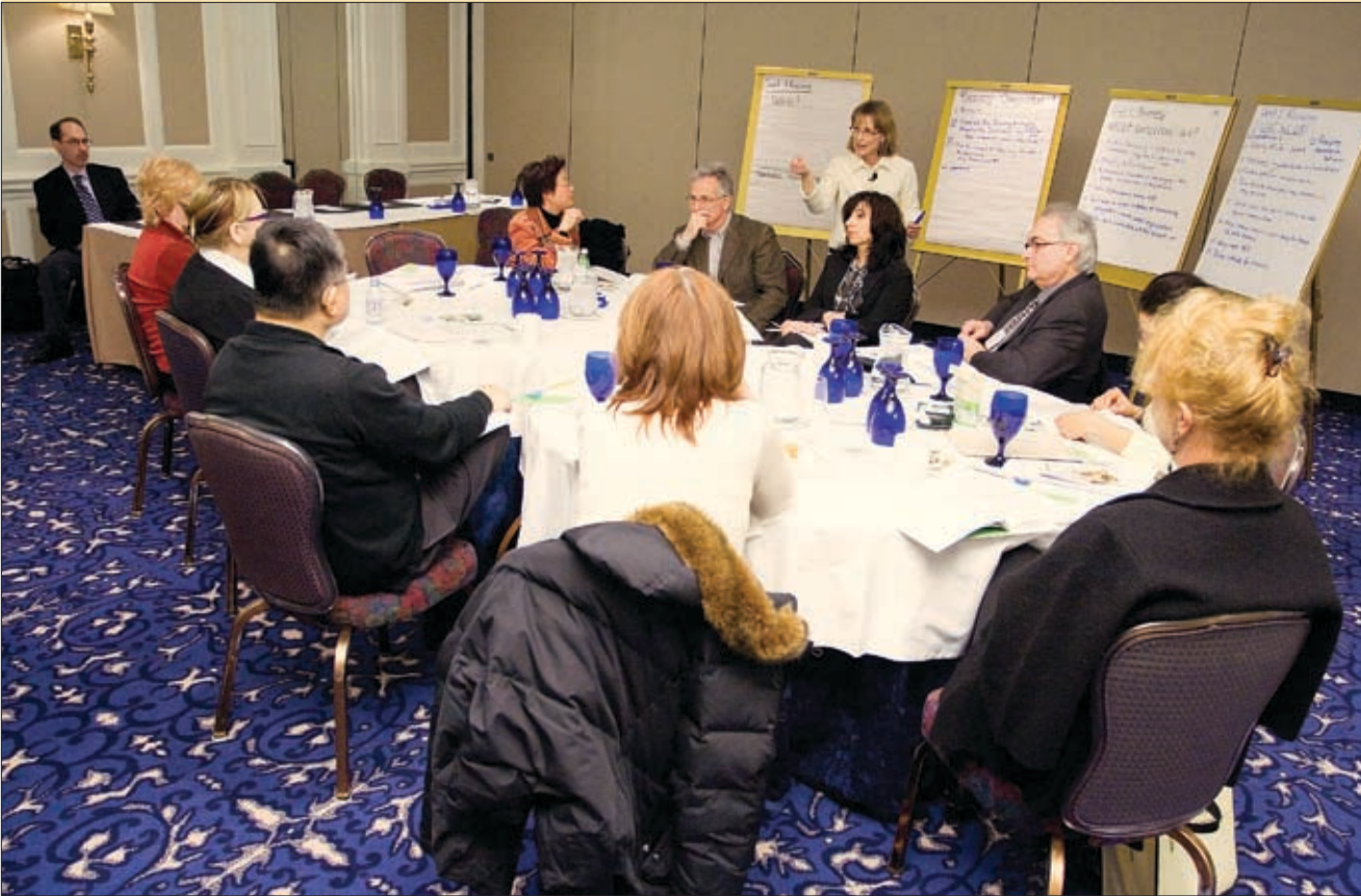
Participants in the Toronto consultation

The Mental Health Commission of Canada has been given the responsibility to initiate and guide a process that will result in the first mental health strategy for Canada.