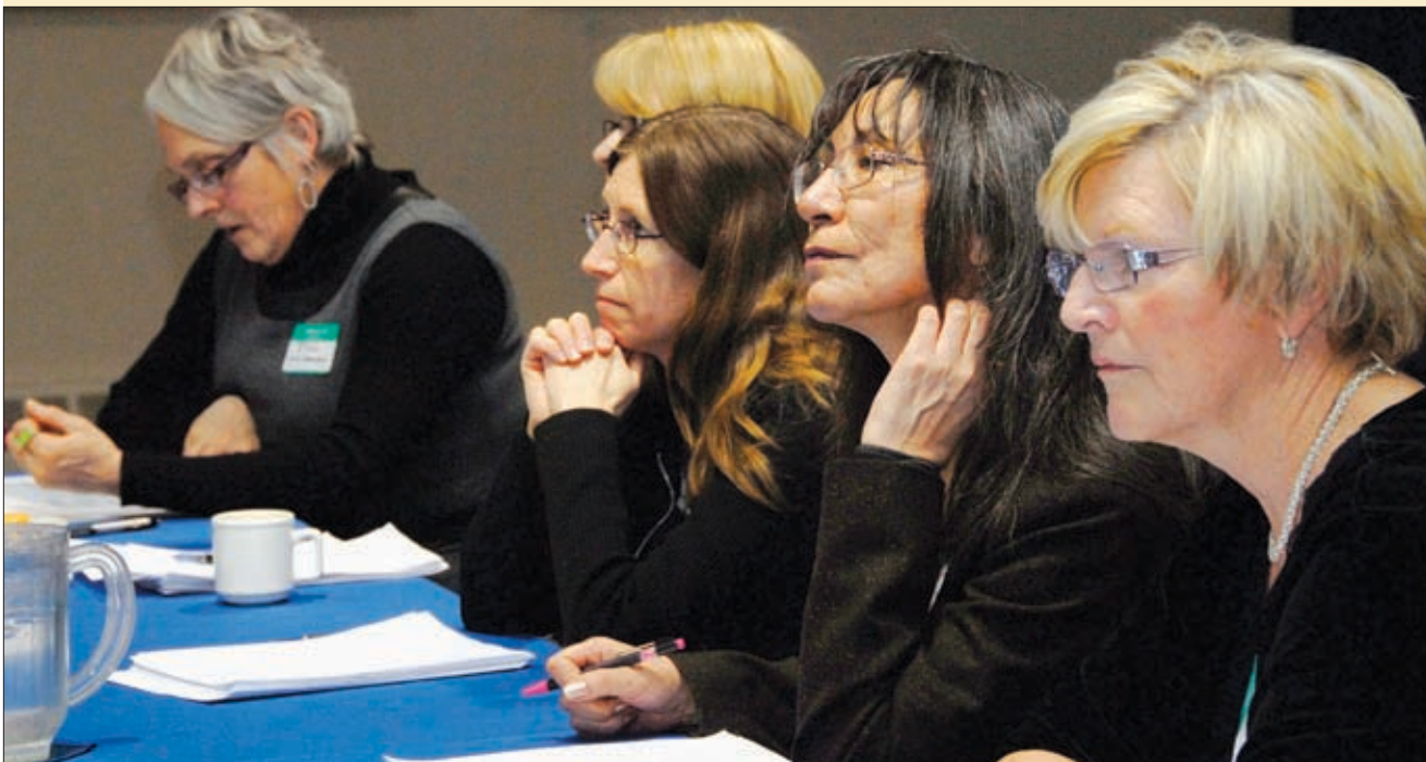
Participants in the Yellowknife regional dialogue